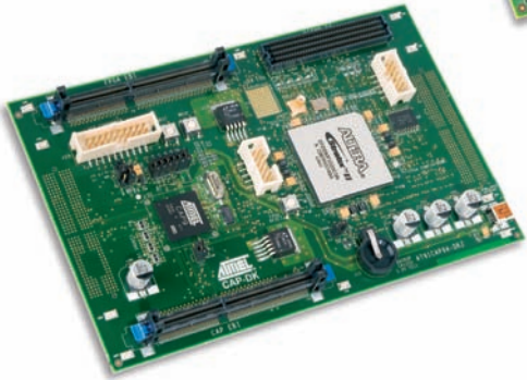
CAP9A Mezzanine Board