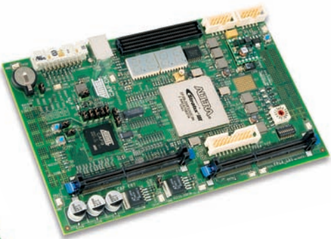
CAP9HA Mezzanine Board