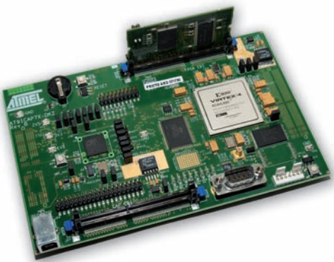
CAP7X Mezzanine Board