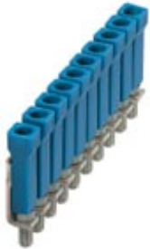
Jumper, Number of positions: 10, Color: blue

Please be informed that the data shown in this PDF Document is generated from our Online Catalog. Please find the complete data in the user's documentation. Our General Terms of Use for Downloads are valid ( http://download.phoenixcontact.com )