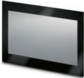
IP65-rated, 15.6-inch, flat -panel LCD monitor with projective capacitive touch screen

Please be informed that the data shown in this PDF Document is generated from our Online Catalog. Please find the complete data in the user's documentation. Our General Terms of Use for Downloads are valid ( http://phoenixcontact.com/download )