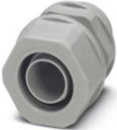
Cable gland made from PP with metric thread, IP65 protection

Please be informed that the data shown in this PDF Document is generated from our Online Catalog. Please find the complete data in the user's documentation. Our General Terms of Use for Downloads are valid ( http://phoenixcontact.com/download )